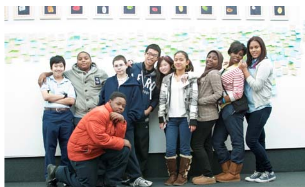
Group shot of kids in Photography class

In addition to implementing the aforementioned special project, SHS members are being asked to provide a very important basic service. This year, at Washington Elementary, there is only one grade per class with an average of twenty-seven students, as a result of significant cuts in personnel owing to the current financial crisis. Many of the teachers have asked me if SHS could provide volunteers to assist them in their classrooms. You can give as little as an hour or two a week, and you can choose the subject matter and age of the students with whom you would like to work. Please contact Phyllis Denbo at 215.755.2734 or prdenbo@gmail.com if you're interested in becoming involved.