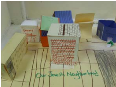
Our Jewish Neighborhood

Students in grades three through six are now "traveling" to Jewish Communities throughout the world. Can we find out what Chinese Jews eat on December 25? Are there Jews in India?