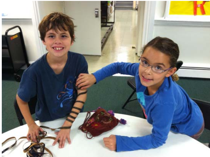
Third graders learn about tefillin as part of the "Jewish Symbols" theme elective.

I wish you all a happy and meaningful Thanksgiving!