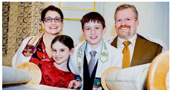
Debbie Zak Cohen PHOTOGRAPHY