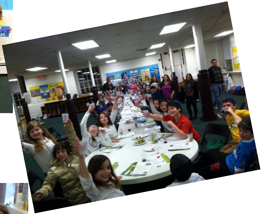
Hebrew School Tu B'Shvat Seder.