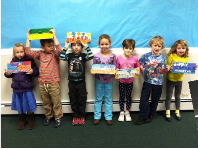
First Grade students proudly display the hanukiyot they made.