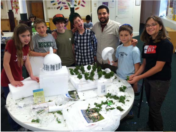
Seventh grade students and the edible kibbutz they designed.