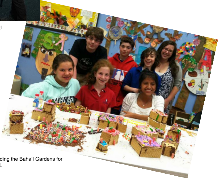
Sixth grade students building the Baha'i Gardens for the Israel 65 Parade float.