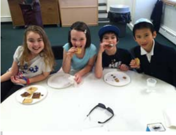
Hebrew School students enjoy s'mores for Lag B'omer

On Sunday, May 19, the Greater Philadelphia Jewish Community is coming together to celebrate Israel's 65 th birthday! Events will include a parade from Eakins Oval to the Pennsylvania Convention Center from 11 AM until noon, followed by