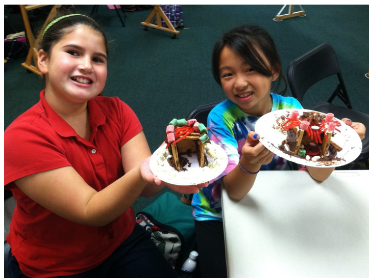
(Edible sukkah creations)