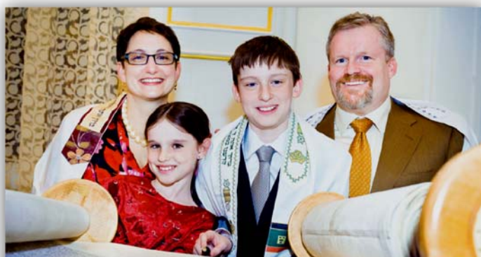
Debbie Zak Cohen PHOTOGRAPHY

The camp season begins on Monday, June 2, and extends for eight weeks through Thursday, July 24. Camp is in session Monday through Thursday, 8:30 AM until 12:30 PM. Children can be enrolled for the full eight-week program, weekly, on a Monday and Wednesday schedule, a Tuesday and Thursday schedule, or daily. Our camp program offers indoor and outdoor play, themed arts and crafts projects, circle time, storytelling, bike-riding, creative movement, camp songs, and water fun in our wading pools. Each day, a healthy snack is provided by one of our families and children bring their own dairy lunch. Summer is almost here and now is the time to make plans for your child. Please contact the Playschool office for more information or to obtain an application.