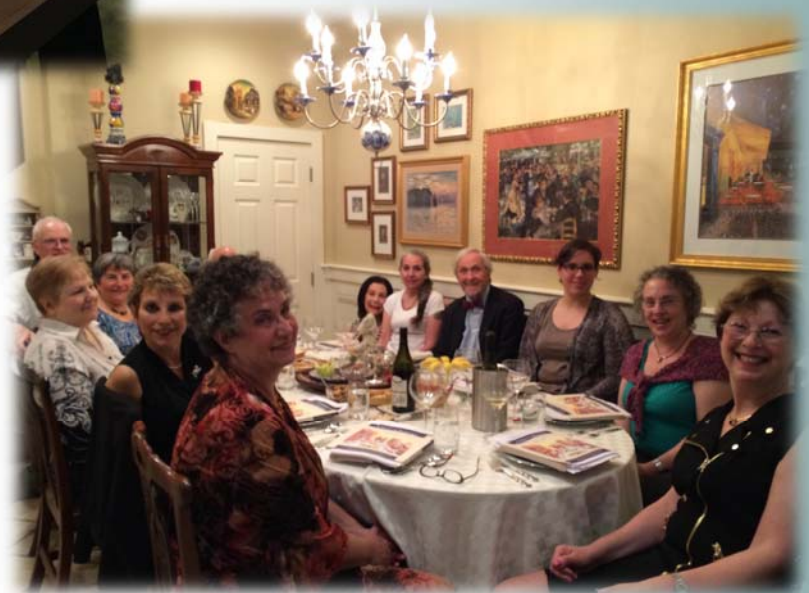
Right: Holiday Meals Initiative Seder