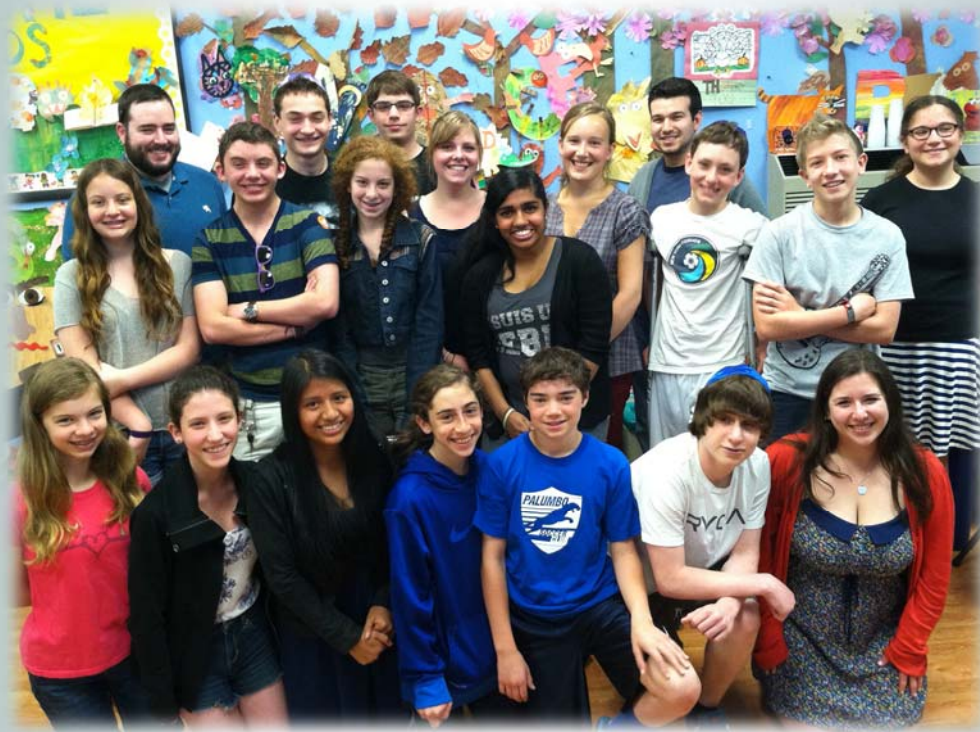
Action Reconciliation Service for Peace (ARSP) volunteers from Germany meet with students in grades 7-11 to discuss Holocaust education, reconciliation, tikun olam, and right wing extremism in Germany today.