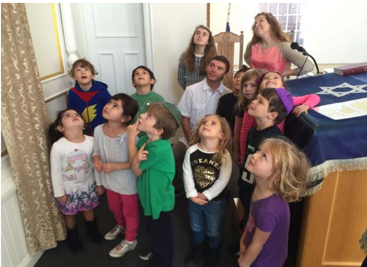
Young Sunday Schoolers look up at the Ner Tamid.

Don't miss this opportunity to have a delicious meal and great conversation—all while supporting this community-building and fund-raising event for our shul. Remember, spaces are limited, so be sure to respond quickly to ensure that you will have your choice of cuisine.