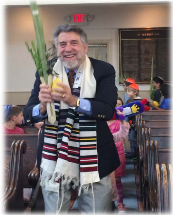
Family Service Sukkot Parade

I wish each of you a reflective, joyful, and delicious Thanksgiving holiday.