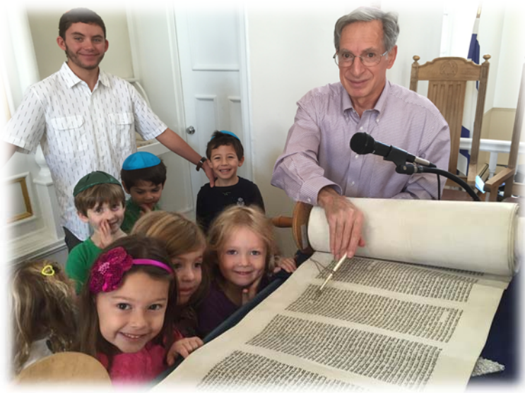
Getting up close with the Torah.