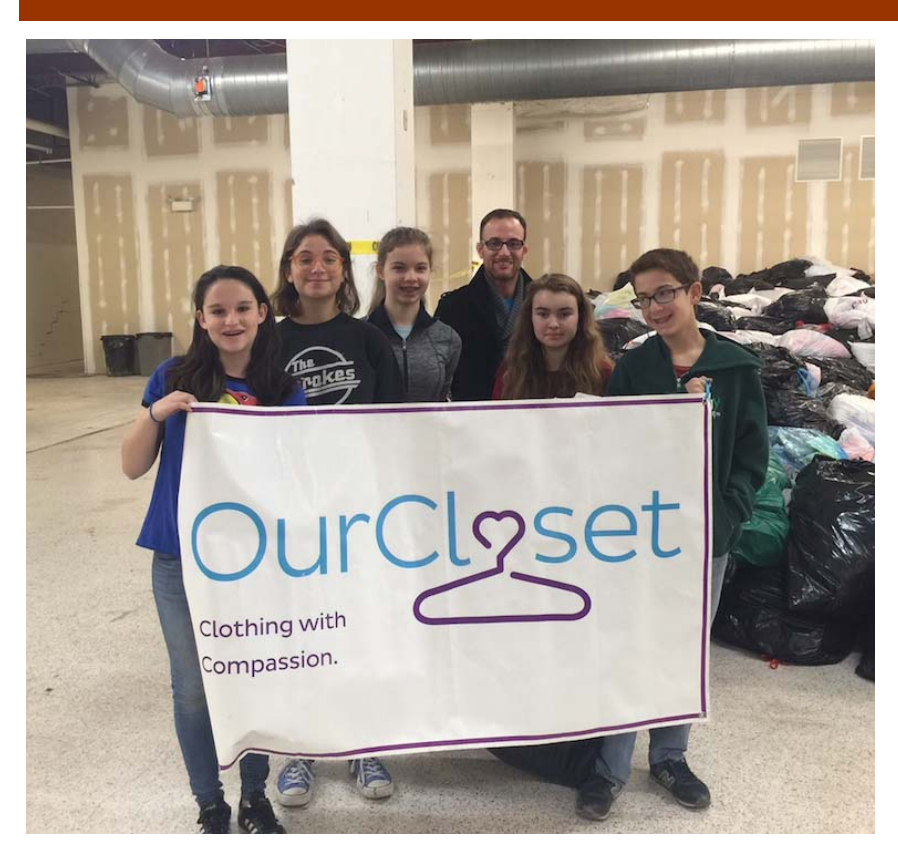
Hebrew High teens at Our Closet's warehouse in Springfield, where they helped to sort and prepare donated clothing for upcoming pop-up shops that provide free clothes to neighbors in need.