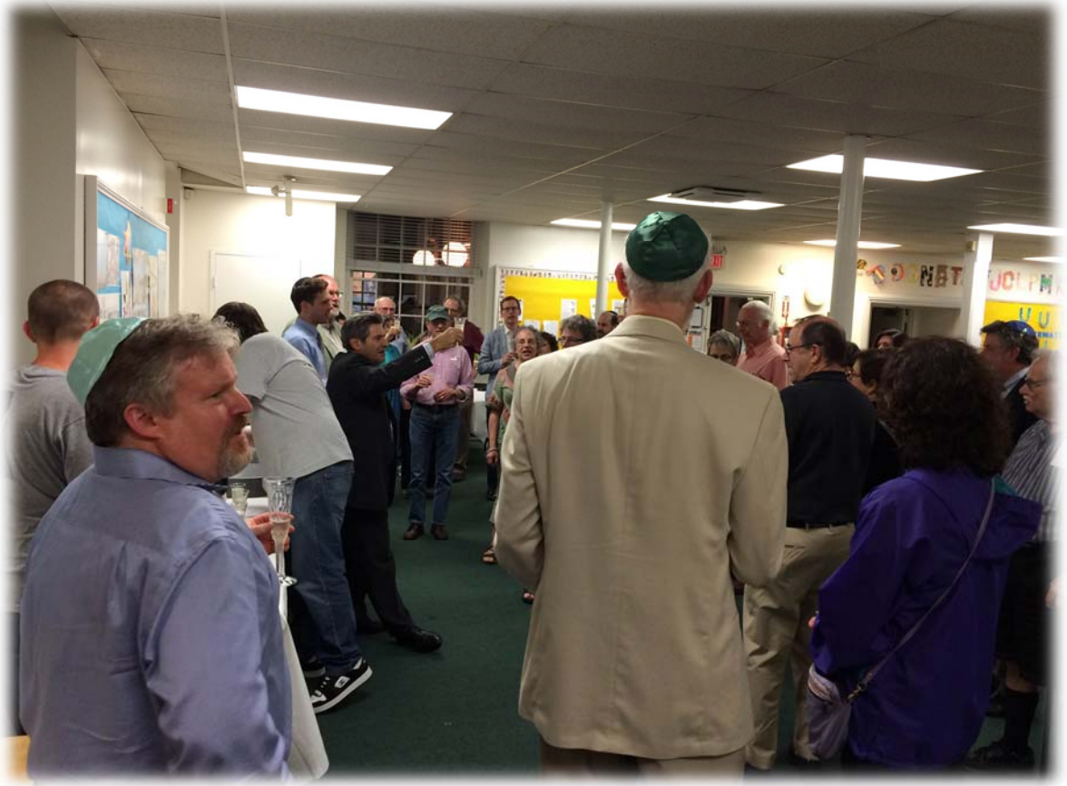
2016 Congregation Annual Meeting