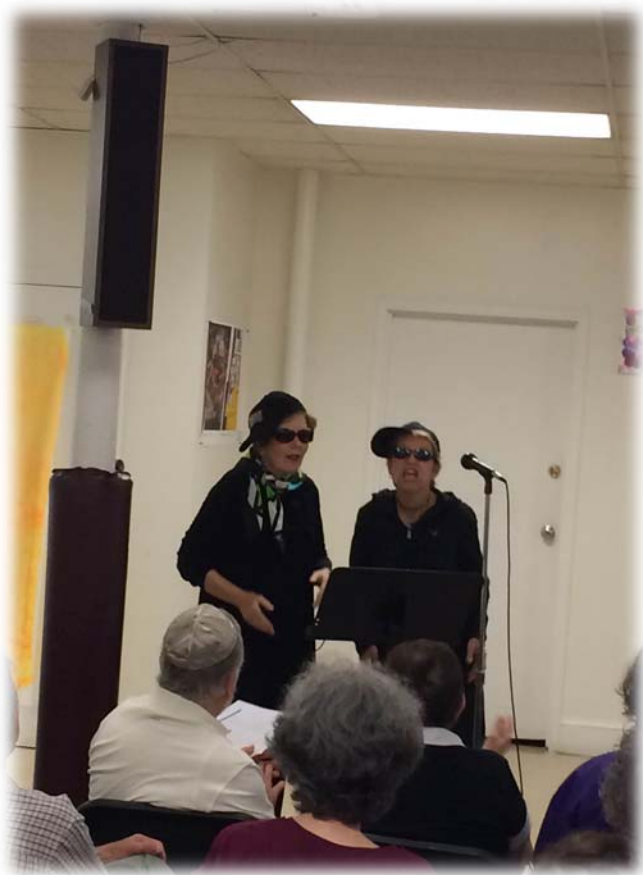
"Rapping It Up" at the beginning of the Annual Congregation Meeting