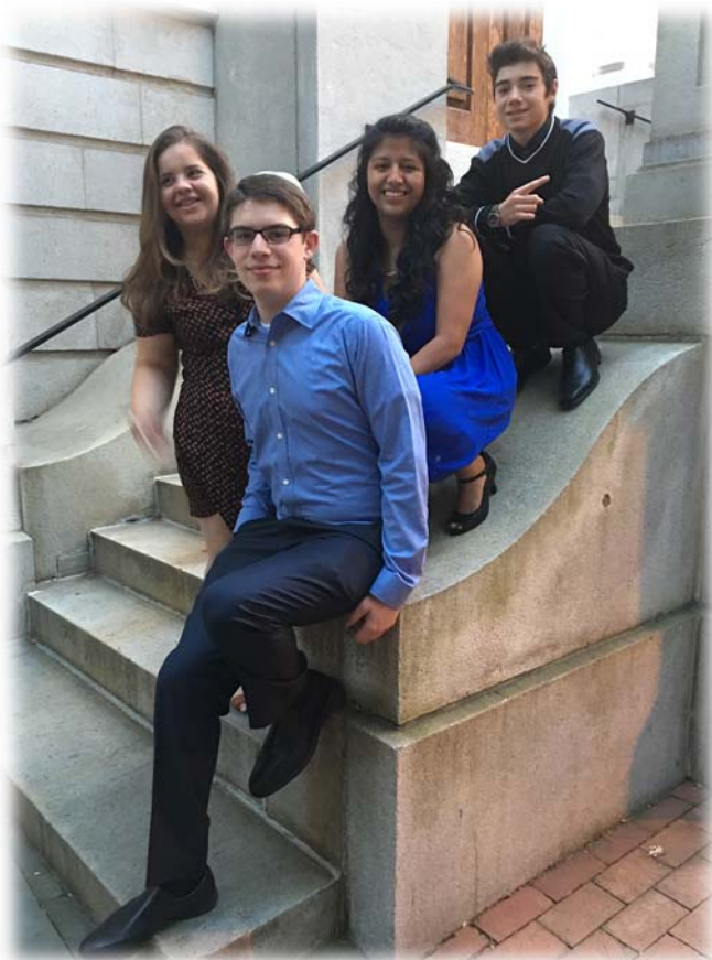
2016 Confirmation Class