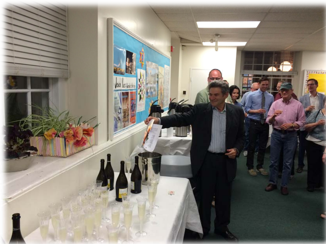
Burning of the 430 Spruce Street Mortgage at the 2016 Congregation Annual Meeting