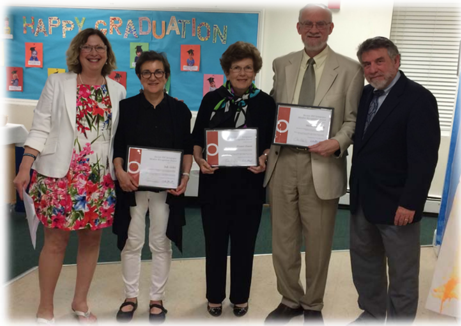
2016 Exceptional Service Honorees (Joe Oxman not pictured)