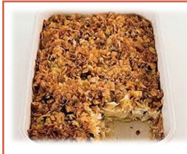
1/2 cup of pecan halves, finely chopped 3 tablespoons of unsalted butter, melted Salt